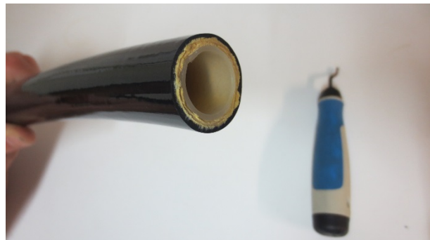
Use a proper tool to remove burrs and/or residual from the cut surface.