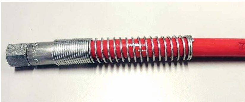
Hose assembly with a spring guard protection.

After having suitably crimped the fitting termination (see following sections for detailed instructions), slide the spring guard over the ferrule and make sure that its outward end is raised over the ferrule enough to guarantee a suitable interference and allow the spring guard to firmly remain in place, approximately a couple of centimeters.