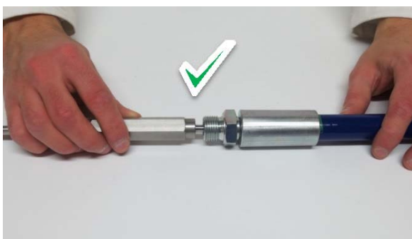
1. Go side must slide through the whole length of the insert