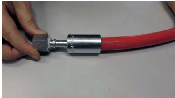
Marking the insertion depth of the ferrule and then put insert into the hose.